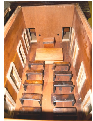
Inside the sanctuary, facing the pulpit