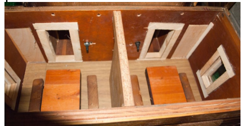
Inside the educational building