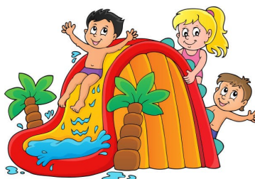
Inflatable water slide!