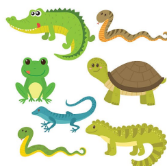
Reptile Zoo! Eek!