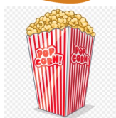
& we're working on even more fun stuff!